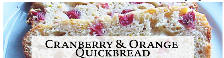
CRANBERRY & ORANGE QUICKBREAD