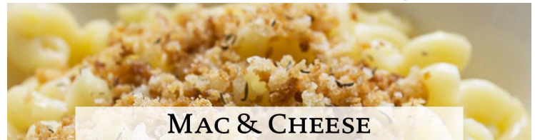
MAC & CHEESE