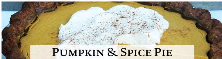
PUMPKIN & SPICE PIE